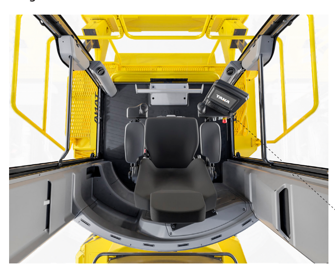
Spaceous cabin with excellent visibility for operational safety & efficiency.